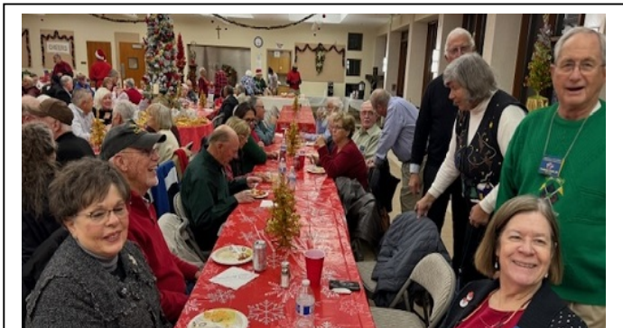
The Ponderosa family