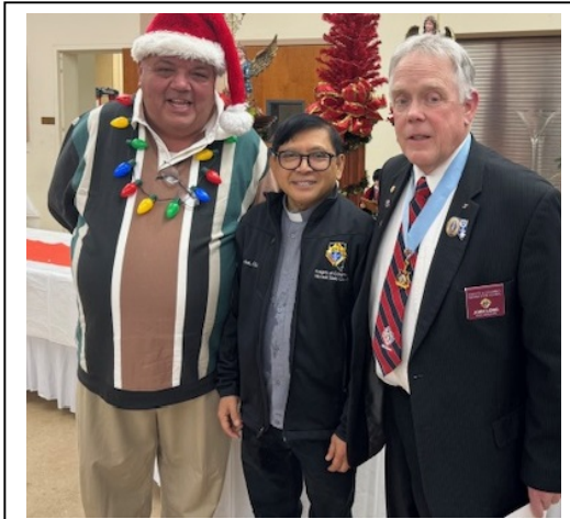
State Council Carew, Arlon, Long