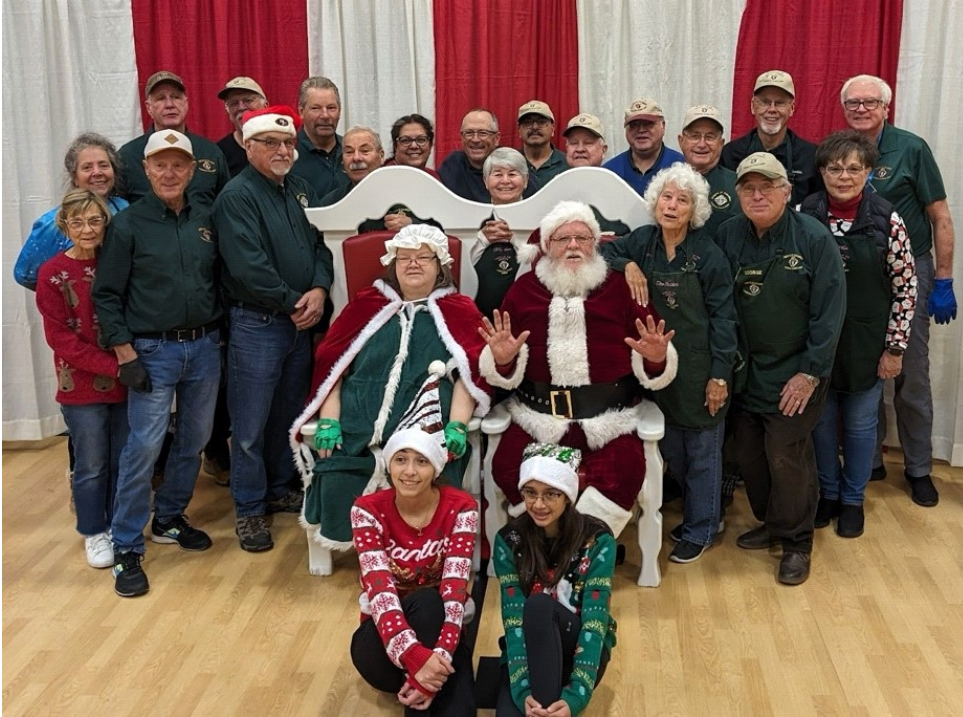
Santa and his elves