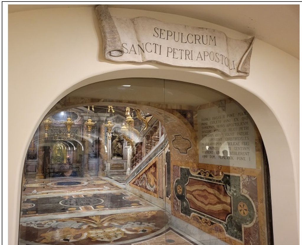
St Peter's tomb